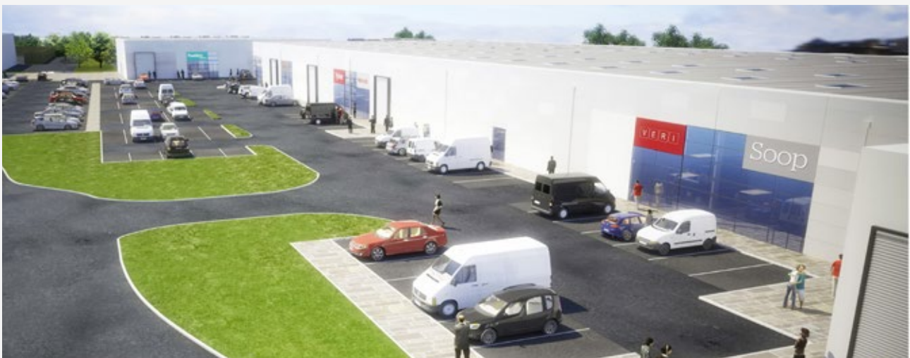
CGI image of proposed scheme