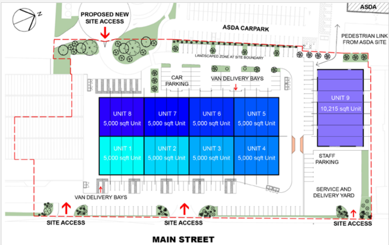
Proposed site layout

The attached illustration provides an indicative plan showing the general outline of the development however these plans can be adapted to suit specific tenant requirements. For more detailed information on the construction type and general specification, please contact the letting agents.